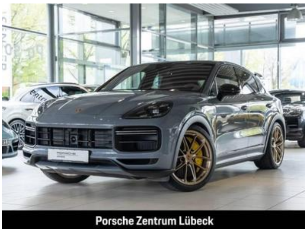
Porsche Zentrum Lübeck