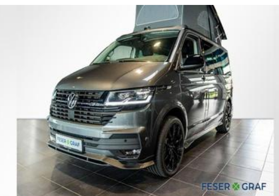
FESER 😵 GRAF