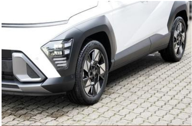
Nord-Ostsee Automobile Lust auf Leistung