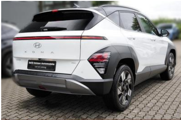
Nord-Ostsee Automobile Lust auf Leistung