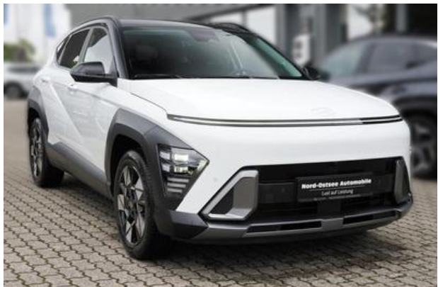
Nord-Ostsee Automobile Lust auf Leistung