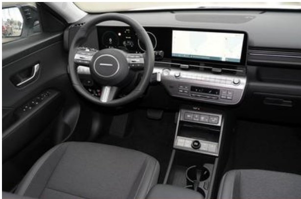
Nord-Ostsee Automobile Lust auf Leistung