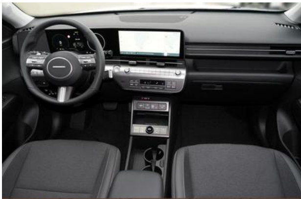
Nord-Ostsee Automobile Lust auf Leistung