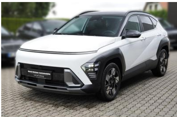
Nord-Ostsee Automobile Lust auf Leistung