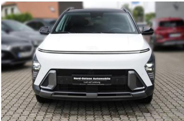
Nord-Ostsee Automobile Lust auf Leistung