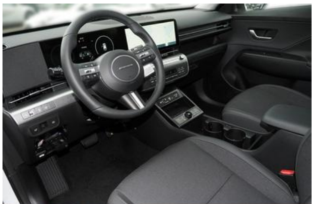
Nord-Ostsee Automobile Lust auf Leistung