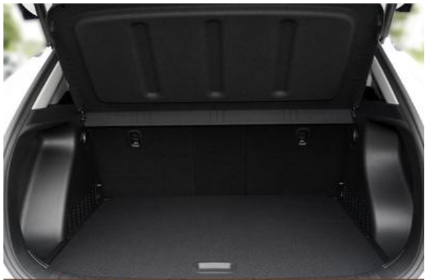
Nord-Ostsee Automobile Lust auf Leistung