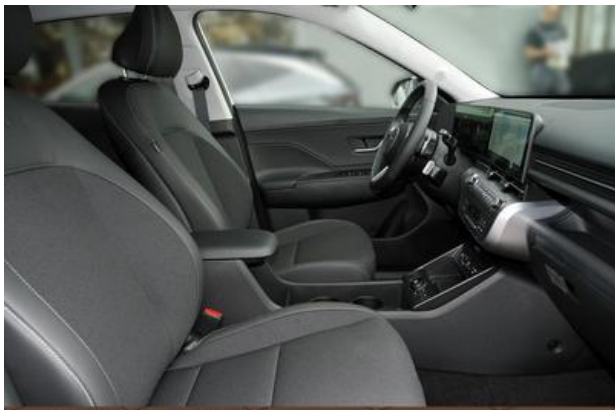
Nord-Ostsee Automobile Lust auf Leistung