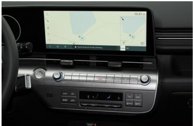
Nord-Ostsee Automobile Lust auf Leistung