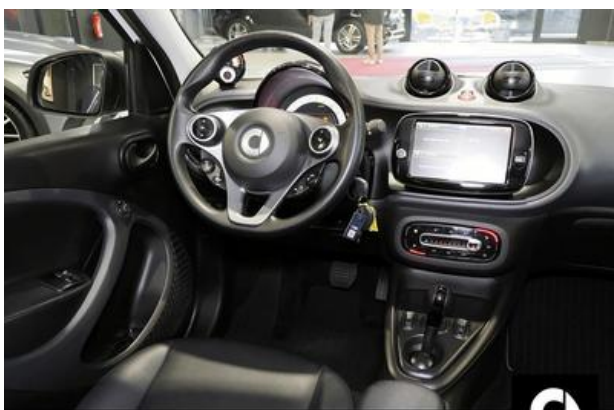
Nord-Ostsee Automobile Lust auf Leistung