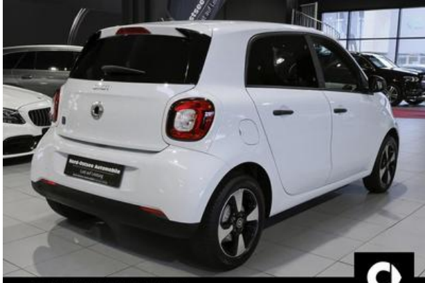
Nord-Ostsee Automobile Lust auf Leistung