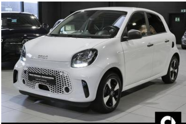
Nord-Ostsee Automobile Lust auf Leistung