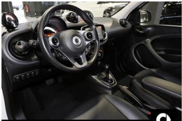
Nord-Ostsee Automobile Lust auf Leistung