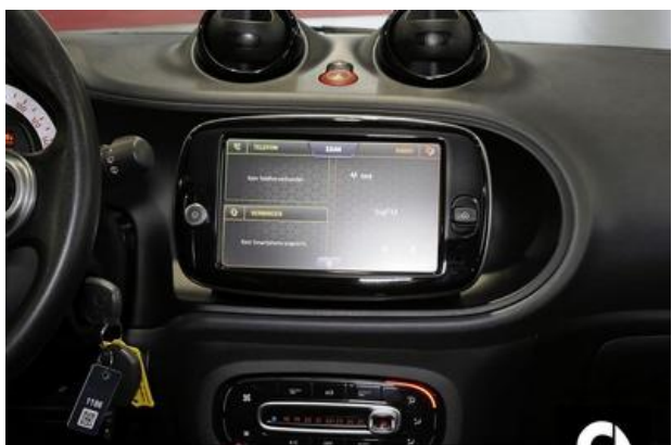
Nord-Ostsee Automobile Lust auf Leistung