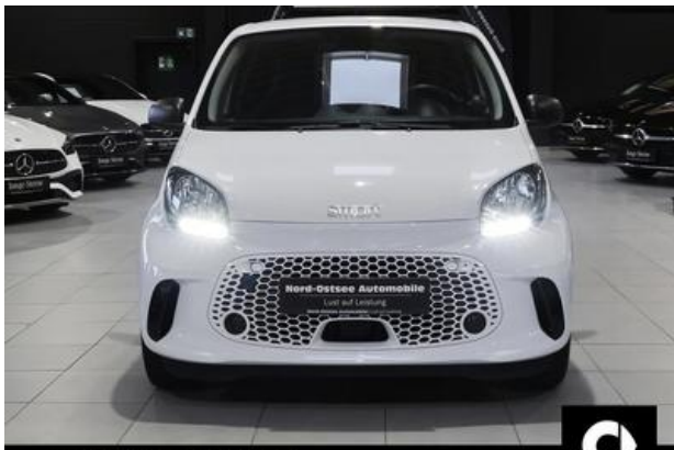
Nord-Ostsee Automobile Lust auf Leistung