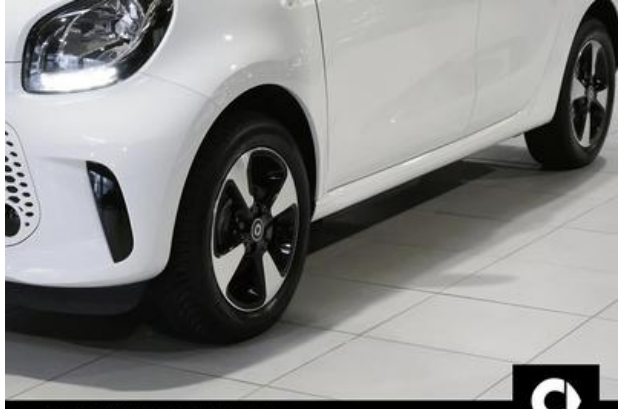
Nord-Ostsee Automobile Lust auf Leistung