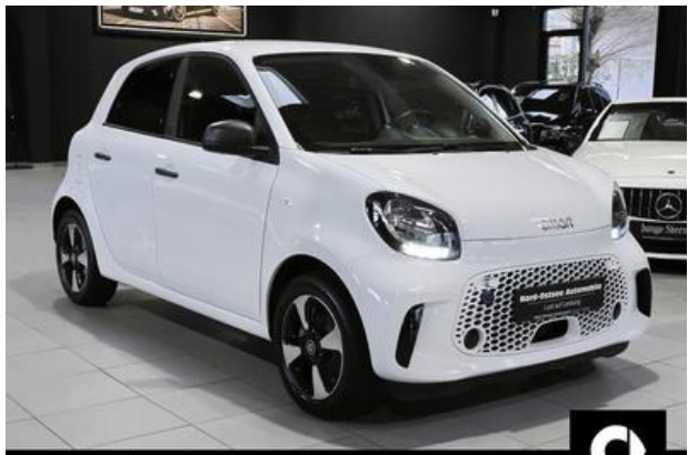
Nord-Ostsee Automobile Lust auf Leistung