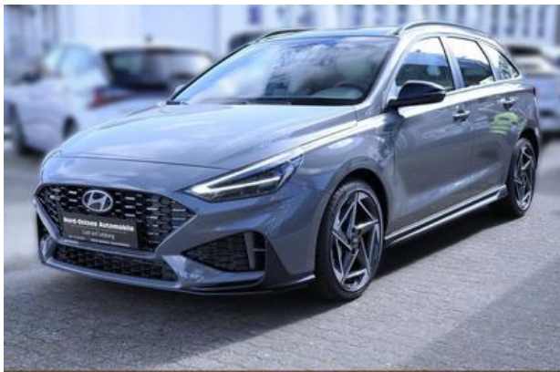
Nord-Ostsee Automobile Lust auf Leistung