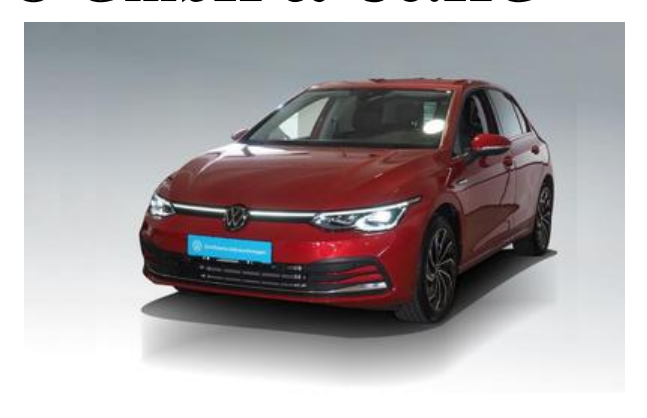
AUTO-SCHOLZ Auto-Scholz AHG lingo GmbH & Co. KG